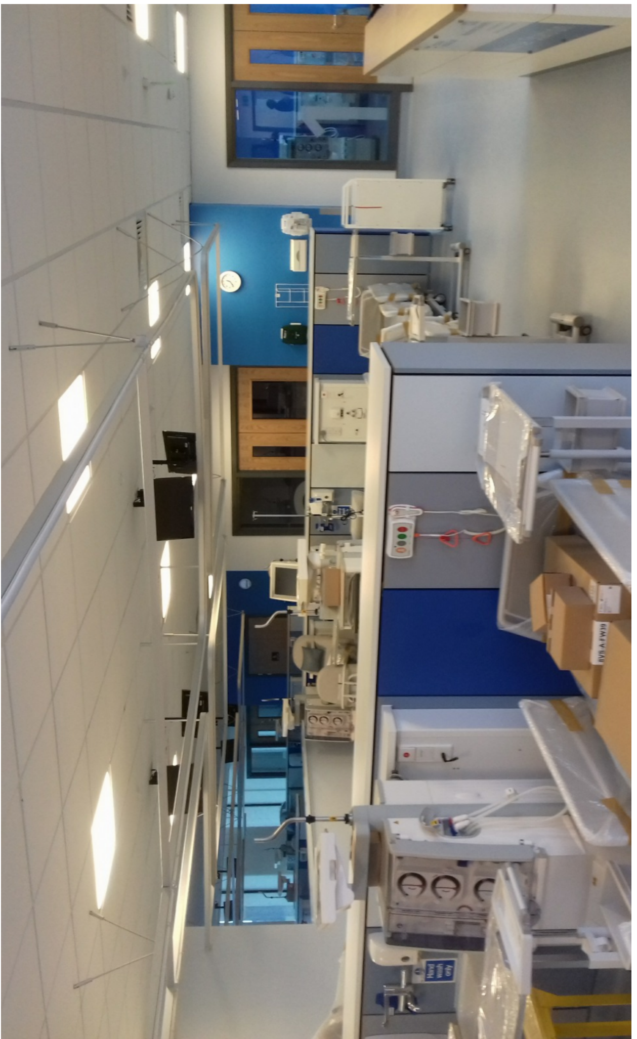
Hexagon Hse - maintenance unit